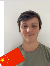
Nĩ hảo Fynn