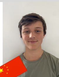
Nĩ hảo Fynn