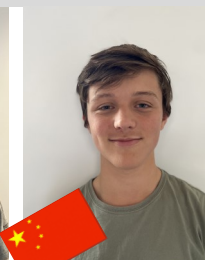
Nĩ hảo Fynn