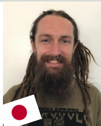
Yaho Will QA1 Educational Program & practice